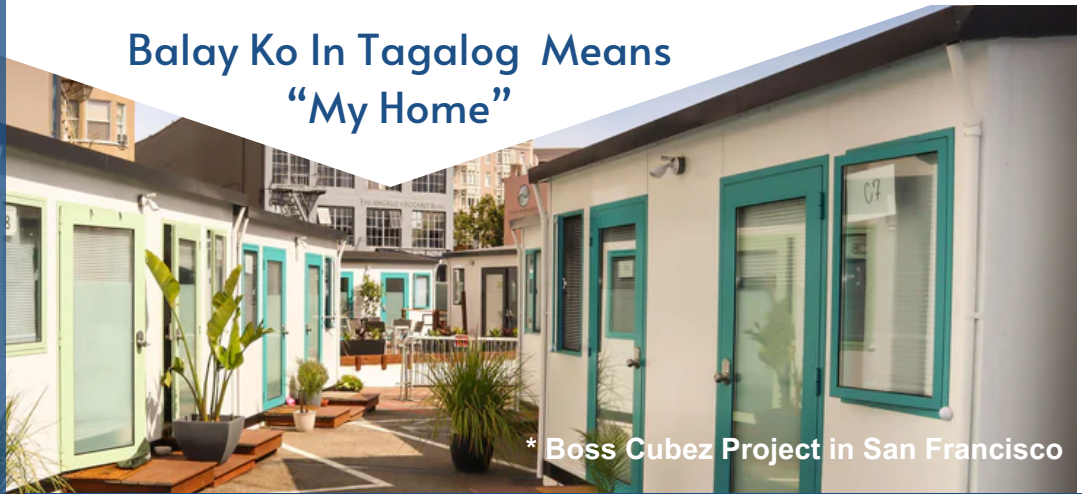
* Boss Cubez Project in San Francisco

5Cities Homeless Coalition (5CHC), in partnership with the County of San Luis Obispo (SLO) and City of Grover Beach, is implementing the second temporary emergency housing project in Grover Beach to help those experiencing homelessness in SLO County achieve the ultimate goal of permanent housing. Following the success of the Cabins for Change project opened in December 2022, this resource has proved its value to both those in need and their communities.